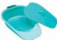
Slipper Bed Pan