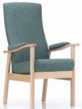
High Back Armchairs