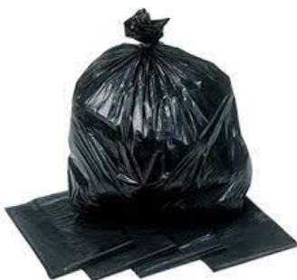
Heavy Duty Black Bags