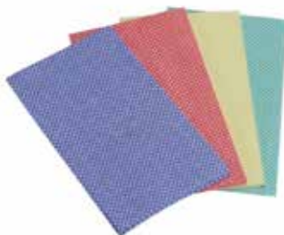
Coloured J Cloths