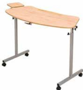
Over Chair Table