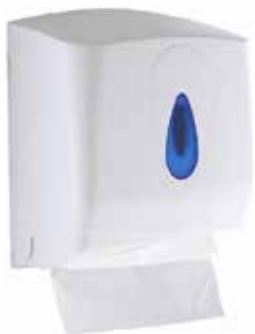
Hand Towel Dispenser