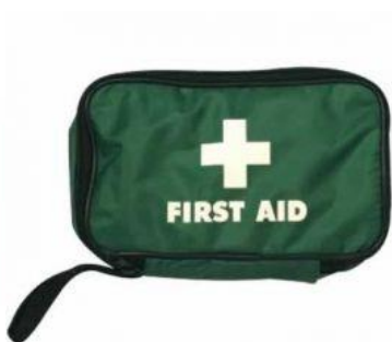
Single First Aid Pouch