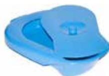
Vector Bed Pan