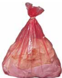
Dissolvo Laundry Sacks