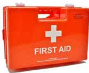
BS Burns Kit