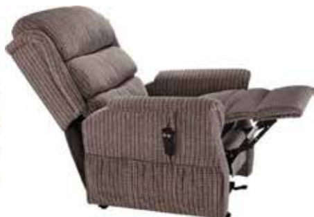
Rise & Recliner Armchairs