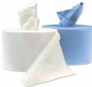
Centre Pull Rolls