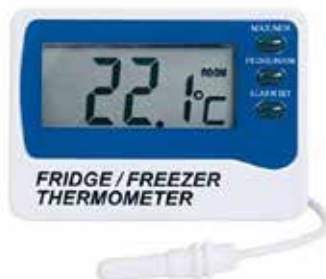
Fridge Freezer Thermometer