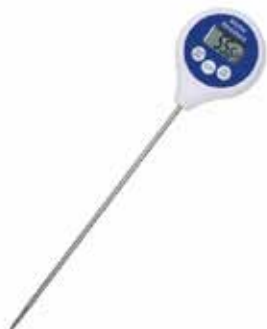
Water Resistant Thermometer