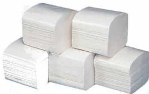
Bulk Toilet Tissue