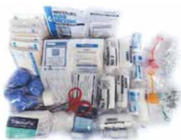
First Aid Refill Kits