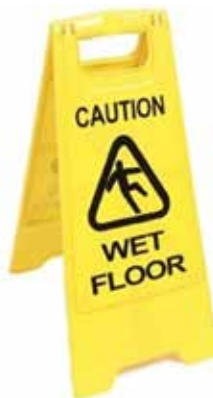
Wet Floor Sign