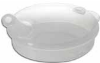
4mm & 8mm Lids