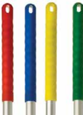
Coloured Mop Handles