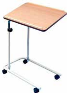
Over Bed Table