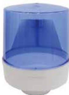
Centre Pull Dispenser