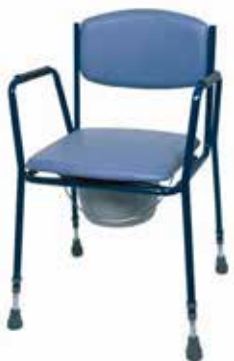
Adjustable Height Commode