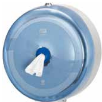
Centre Feed Toilet Roll Dispenser