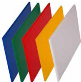
Chopping Boards & Rack