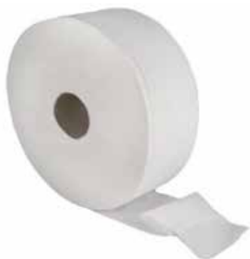
Mini & Jumbo Toilet Rolls