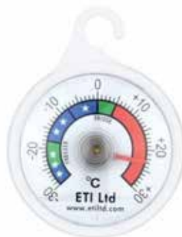
Fridge Freezer Thermometer