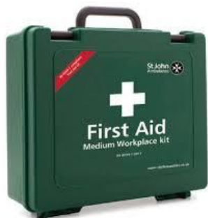
Workplace First Aid Kit