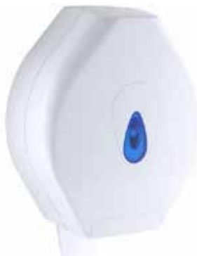
Toilet Roll Dispenser