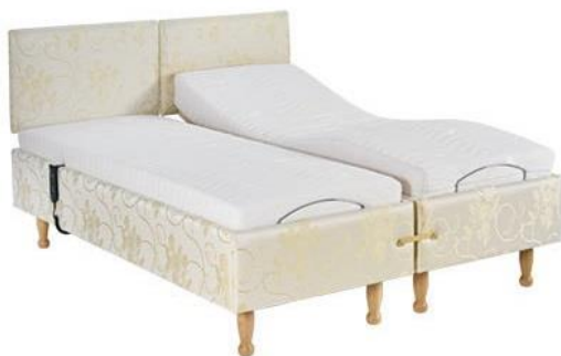
Electric Adjustable Beds