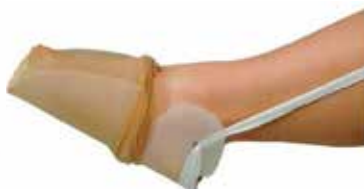
Tights & Sock Aids