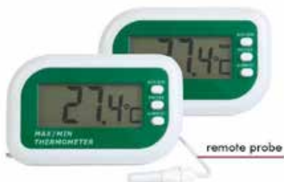
Med's Cabinet Thermometer