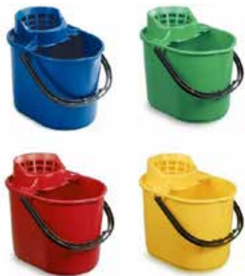
Coloured Mop Buckets