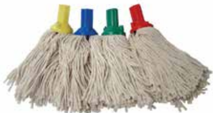
Coloured Mop Heads