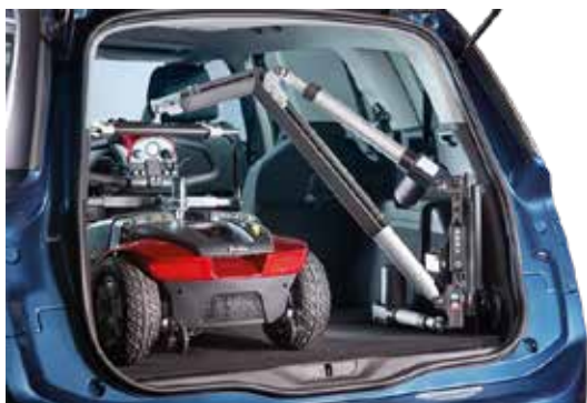
Scooter & Wheelchair Boot Hoists

For our full range of products please request a 'Days Mobility' catalogue or visit our website