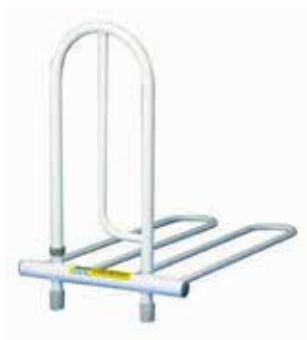
Easy-leaver Bed Rail