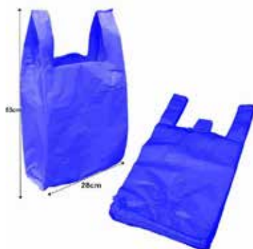
Blue Nappy Bags