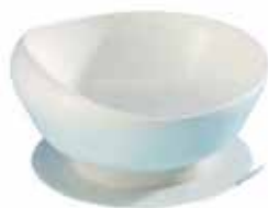
Suction Base Bowl