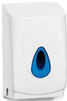
Toilet Tissue Dispenser