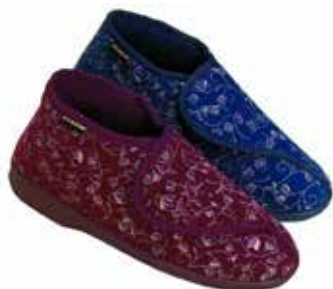
Slippers & Booties