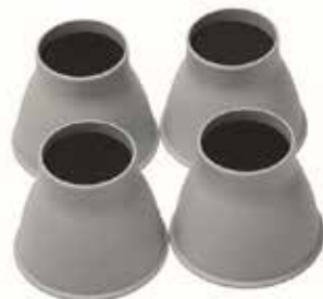
Bed & Chair Raisers